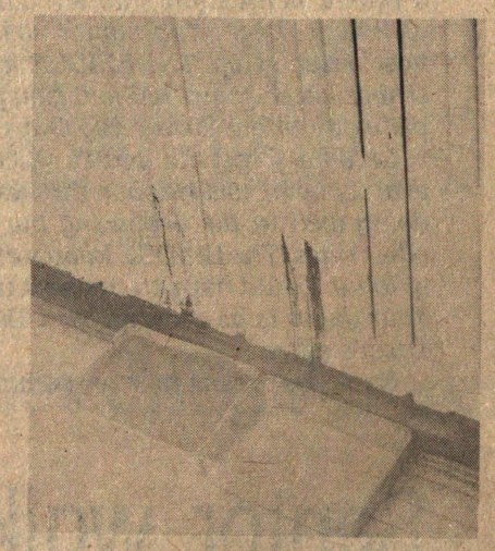
Cake pans serve as a temporary repair measure.

"If you figure that it takes 15 minutes for the custodians to stop what they're doing, get the tools they need to fix the new emergency job, and then 15 minutes to get back to the first job, a lot of time is lost everytime something like that happens,"