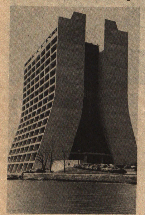
Main building at Fermilab.

Your trip might start at the main laboratory on the fithteenth floor. On this floor there is a ten minute slide show to give