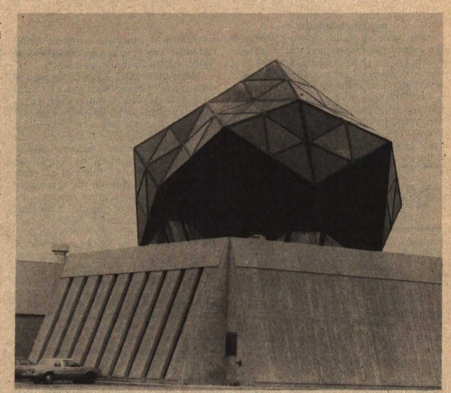
This geodesic dome is located in the neutrino area of the laboratory. It is constructed of discarded cans sandwiched between polyester-reinforced fiber glass. The dome contains 120,000 cans, which were donated by the public.

With the price of gas over a dollar, why not take a day and go through a place where few visit? A place called Fermilab.