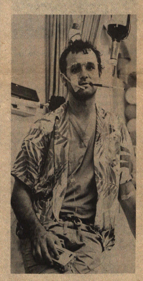
Booze, music, and cigarettes help the doctor make it through a busy day in Bill Murray's latest starring role.