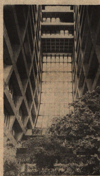
Plants flourish abundantly inside the arched windows inside the main building.